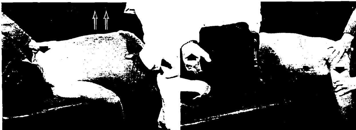
Fig. 5. The position of the hands of the two operators as one gets ready to rotate the pelvis to the right about the left oblique axis of the sacrum. Left, view from the back; right, view from the front.

ator places the patient in a modified left lateral Sim's position. The operator flexes and extends the knees and hips until the forces are localized at the lumbosacral junction. He produces sidebending to the left, rotation to the left, and backward bending of the spine at the lumbosacral junction. When all vectors of force are localized at the point where motion of L-5 is restricted, the operator applies a high velocity-low amplitude force to "free-up" the joint. Most of the time this type of osteopathic lesion or joint strain can be effectively treated by functional forces without anesthesia. Usually this can be done with little discomfort to the patient and minimal effort on the part of the operator.