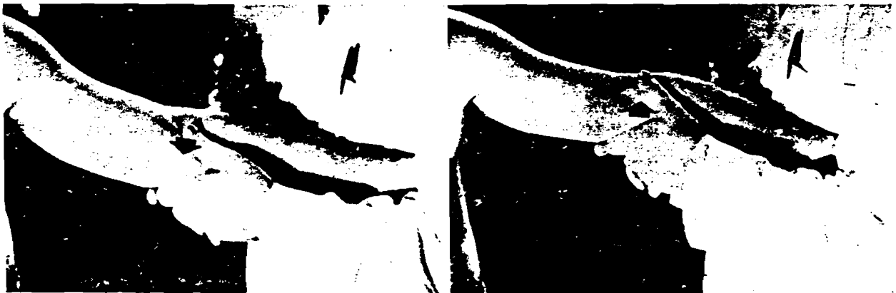
Fig. 1 (left). Abduction of the humero-ulnar joint. Fig. 2 (right). Adduction of the humero-ulnar joint.

For example, if the base of the sacrum is anterior on the right in relation to the posterosuperior spine of the ilium and rotated on its left oblique axis, one will find tenderness over the sacrotuberous ligament and over the superior sacroiliac ligaments on the left side. Since the fifth lumbar vertebra usually moves with the sacrum, its rotation to the right and sidebending to the left will be restricted. This type of osteopathic lesion, which frequently has to be treated under general anesthesia, is discussed by Soden. 13 The pelvis is usually rotated to the same side as the anterior sacrum. One pro-