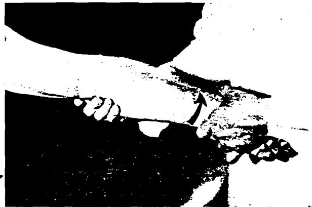
Fig. 3 (left). Pronation of the forearm with rotation of the radius about the ulna. Fig. 4 (right). Supination of the forearm with the radius becoming parallel to the ulna.